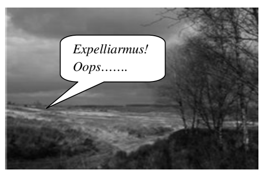
A rarely seen shot of Cromford Rocks with Hogwarts just obscured by the foreground trees